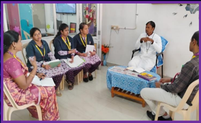
Abacus classes conducted.